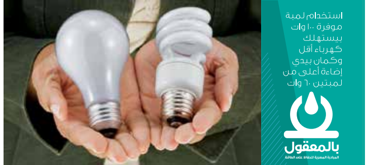
A 100 watt LED bulb not only saves energy but also provides more light than two 60 watt bulbs.

“The ultimate objective is to develop the national economy”